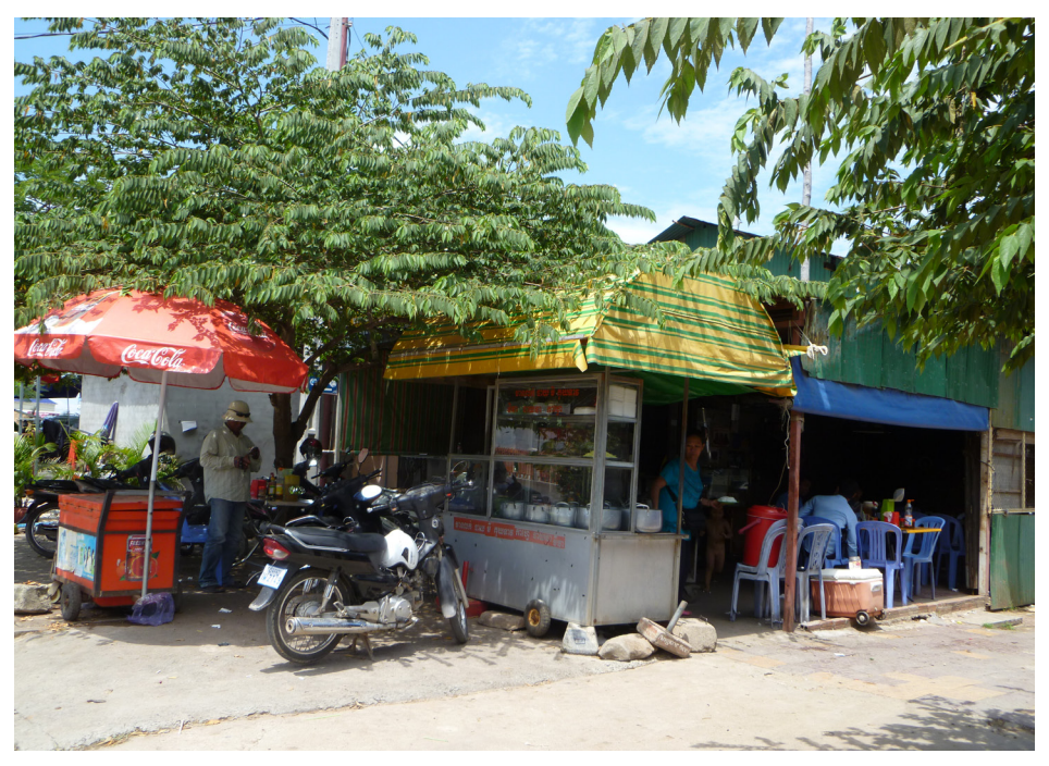
Figure 1: A soup-pot shop front in Phnom Penh.

For this research, I studied a cross-section of the restaurant scene between January and November 2014, representing diners, restaurateurs, and local markets in Phnom Penh. Specifically, I surveyed 120 Phnom Penh residents cluster-sampled across the categories of age, socio-economic class, and gender. I also conducted embedded participant observation in 15 soup-pot restaurants and 9 to-order restaurants in different economic zones of the city. In addition, I accompanied the chefs of 10 restaurants (both soup-pot and to-order) to fresh food markets over a period of 6 months to ascertain the logic behind food purchases and the dynamics of seasonality of vegetables, fish, and fruit. All interviews were conducted by the author in Khmer language and all quotes appearing in this text were also translated by the author.