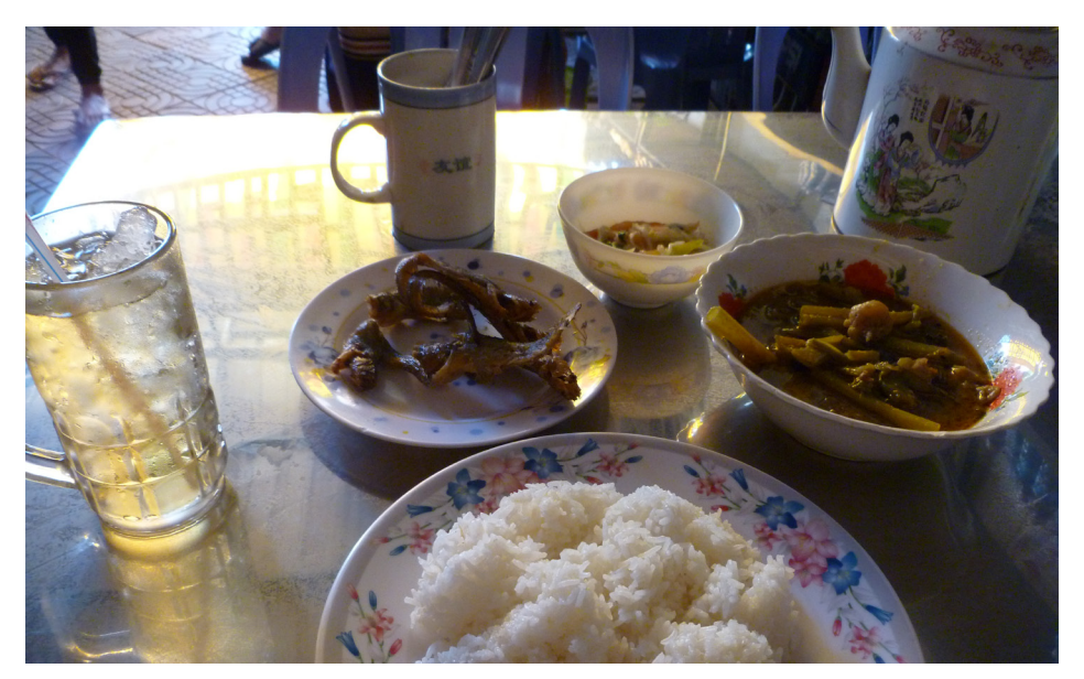
Figure 4: A typical arrangement of Cambodian fare in a soup-pot restaurant.