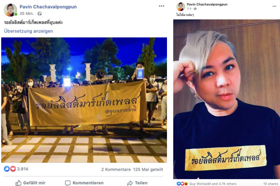
Figure 1 (left). A banner with logo of the Royalists Marketplace at a democracy demonstration in Ubon Ratchathani on 19 July 2020. (Photo taken from the Facebook account of Pavin Chachavalpongpun).

The spectacular success of the Royalists Marketplace, its ban in Thailand, and the reaction of Facebook are watershed events in the development of social media in Southeast Asia, and globally. These incidents also mark a turning point in the power relation between the de-facto social media monopolist of Facebook, the new authoritarian governments that have spread around the world (Einzenberger & Schaffar, 2018), and social movements contesting these regimes in the wake of the COVID-19 crisis.