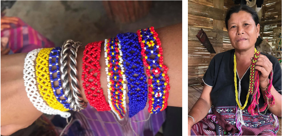
Figure 4 (left). Different styles of handmade bracelets designed by women in the village.