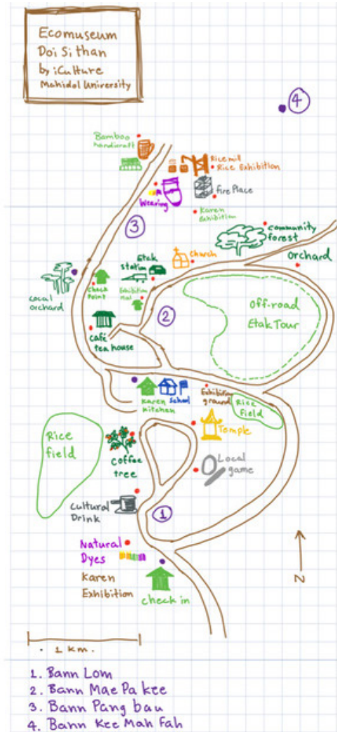
Figure 2. Map of Doi Si Than Ecomuseum. It covers four villages (Bann Lom, Bann Mae pa kee, Bann Pang bua, Bann Kee mha fah) 3 with an indication of intangible and tangible heritage aspects in each of them. (drawing by the authors).

Mue sa to is the signature Karen chili paste (see Figure 3) included in almost every meal and food combination. There are two kinds of mue sa to , wet and dry. Karen chili has become popular with a degree of spiciness. The chili is mixed with garlic, salt, and ma-kan , a local pepper. To prepare it, grilled chili and grilled garlic are mixed and pounded in the mortar. After other ingredients are added, together with almost any kind of meat or vegetable, it is pounded and served. Mue sa to comes in seasonal varieties,