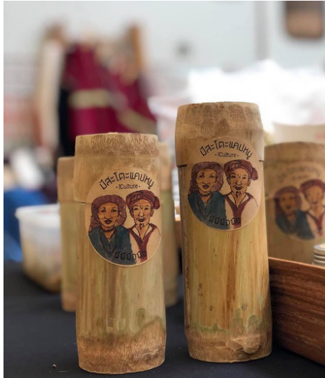
Figure 3. Mue sa to , signature Karen chili paste in a bamboo container made by a villager. A version based on local recipe, with logo and packaging designed by iCulture, is sold on Facebook and in iCraft, the museum shop of RILCA's Vivid Ethnicity museum caravan.

depending on typical ingredients, leading to various types the year round. It is safe to say mue sa to represents the essence of Karen food culture. During this research, the Karen of Doi Si Than modified the meaning of the mortar and mue sa to to serve as cultural products that could be marketed and sold to the public.