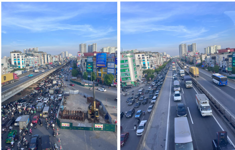
Figure 1. (left) A view of a street junction in Hanoi from Line 2A (author, August 2023)