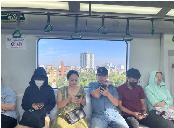
Figure 13. (left) Passengers on Line 2A. (author, August 2023)