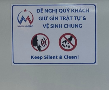
Figure 10. (left) Rules for passengers in Vietnamese and English at Cat Linh station (author, August 2023)