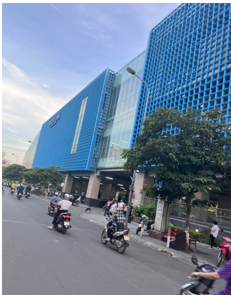
Figure 3. (left) View of the Ha Dong station from a pedestrian bridge (author, August 2023)