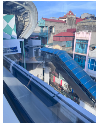
Figure 5. (left) A view of completed tracks from the train (author, August 2023)